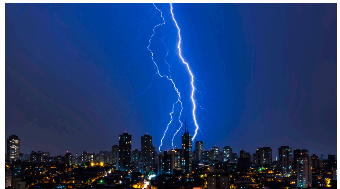
Figure 2. Lightning does not always strike the highest structure

The protection of cellular equipment installed on building rooftops and walls should not be neglected on the basis that adjacent taller structures will protect them. These sites are also at risk because lightning does not always hit the tallest structure, as shown in Figure 2.