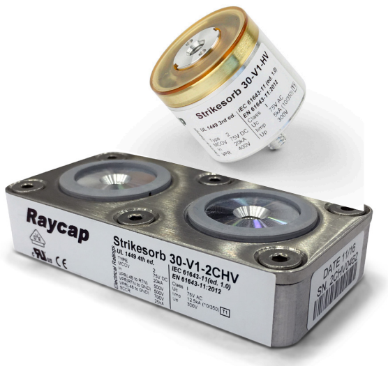
Figure 4. Two of the Strikesorb SPDs from Raycap

Raycap's Strikesorb® technology combines the properties of both Class I and Class II devices in a single design which can withstand lightning currents (rated at up to 25kA 10/350) while also maintaining let-through (residual) voltage levels at close to 100V. The technology has been purpose-designed to provide the required limp and Up ratings needed to protect sensitive electronic equipment found in cell site infrastructures.