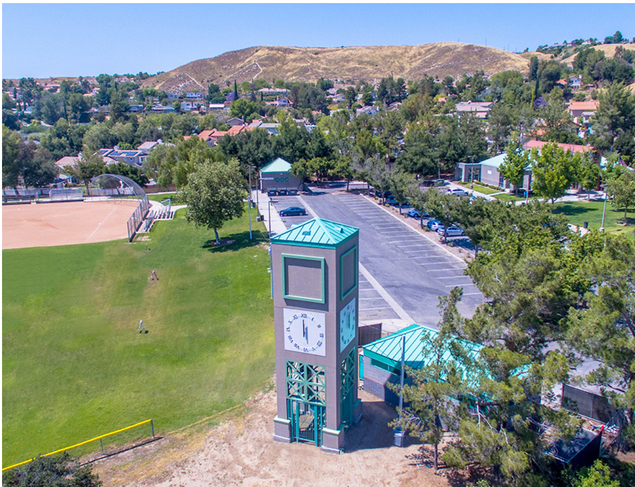
Figure 1. Example fully concealed macro cell site

C-band is being rolled out as an addition to existing cellular services (3G/4G LTE) and ideally, carriers would like to co-locate their new 5G radios within existing macro cell sites (such as the concealed tower example in Figure 1), since these already have electrical and wired communications infrastructure available and are in locations that can provide the required levels of signal coverage.