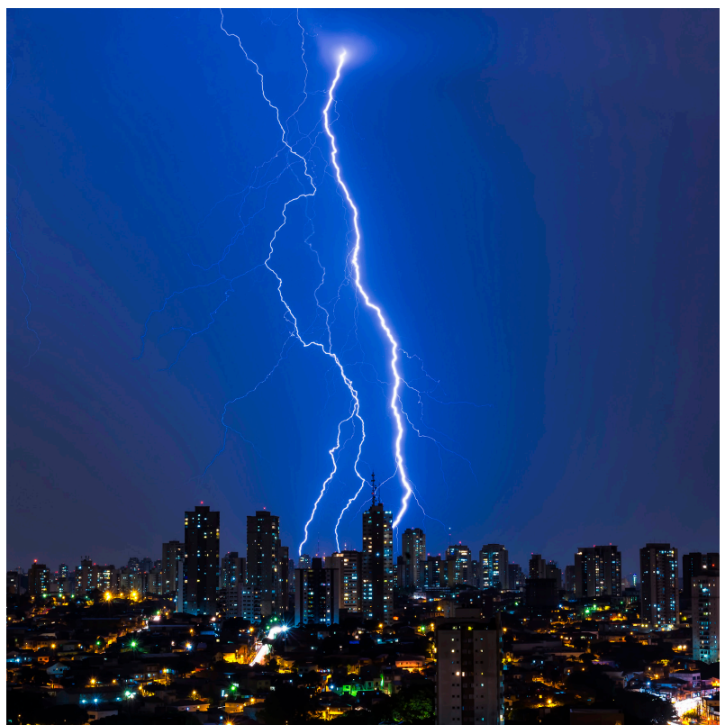
Figure 3. Lightning strikes create electrical surges that may damage 5G equipment

5G equipment operates at higher frequencies than those used in previous generations of mobile telecommunications. Consequently, these radio transmitters require higher power levels, making them more vulnerable to the effects of voltage surges caused by lightning and from other sources. It is important for carriers to ensure that they have a surge protection strategy which provides adequate protection (Class I) for their equipment, especially since many macro cells are situated on the rooftops of buildings and at the top of poles, making them more susceptible to damage from a direct lightning strike.