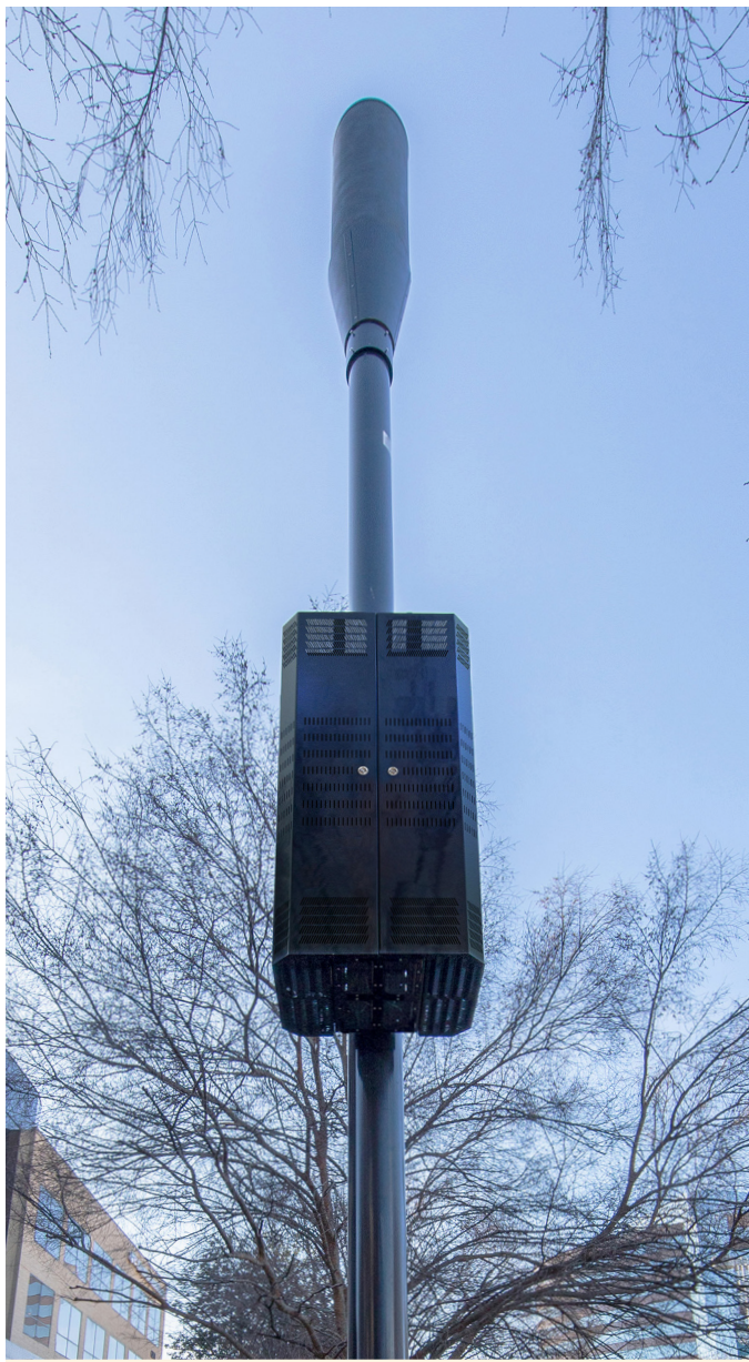
Figure 5. Raycap's pole topper and side mounted shroud small cell solution