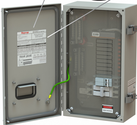
RSD-EMC-Z02MS-21NN (Lt. Gray color, 2 Breakers, Strikesorb SPD, External Disconnect)