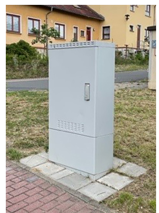
Aluminum enclosures have many advantages such as resistance to weather and ageing, high mechanical strength, easy cleaning and 100% recyclability.