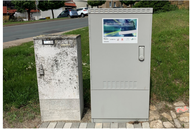
All aluminum Raycap NVT & MFG cabinets in the field, quite a contrast between aluminum and polycarbonate.