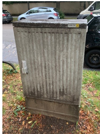
Polycarbonate cabinets get gray and dull with age, and cannot be easily cleaned or brought back to their original exterior look.