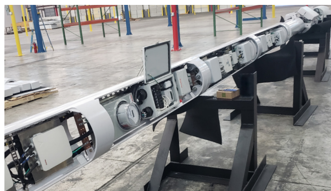
Integrated small cell poles, like this one seen at one of Raycap's three US manufacturing facilities, contain and conceal complete small cell sites.

To meet required coverage patterns, multi-tenant siting and