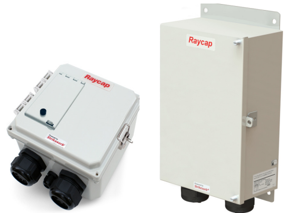
Figure 3. Specialized AC Disconnects from Raycap feature Strikesorb to help protect small cell sites from damage caused by electrical surges

Lightning, wind, and heat will increase as our climate changes, even as the telecom industry rolls out advanced 5G services on macro towers, buildings, and small cells. Therefore, experienced professional design and engineering are required at the buildout stage to ensure that wireless sites can operate reliably under present and expected conditions in the future.