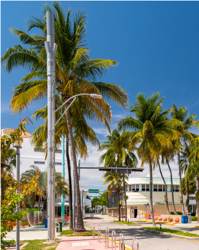
Figure 2. Raycap integrated small cell lightpole in Miami Florida