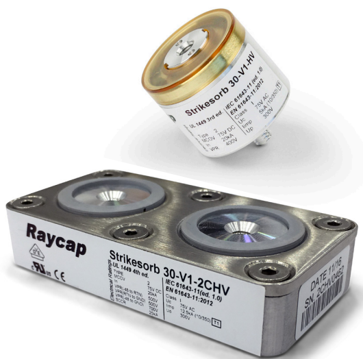
Figure 3. Strikesorb surge protection by Raycap.

Raycap’s Strikesorb® technology (Figure 3) incorporates the properties of both Class I and Class II devices in a single solution which can survive lightning currents (rated at up to 25kA 10/350) while keeping let-through (residual) voltage levels close to 100V.