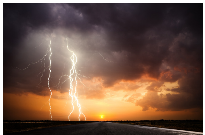
Figure 2. More lightning and more cell sites means a greater chance of network downtime due to lightning if sites are unprotected.