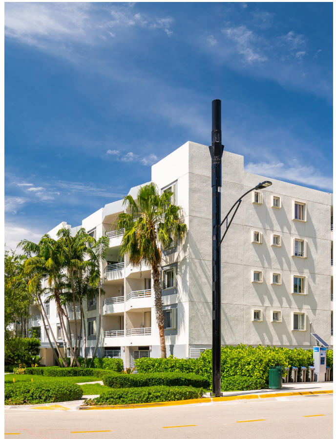
Figure 3. A small cell pole with 4G and 5G equipment installed in Miami Florida and customized to withstand windloads

Major municipalities have regulations on pole wind shear strength that take into account the expected intensity of local storms. These regulations are likely to become increasingly stringent, pacing the growing severity of storms.