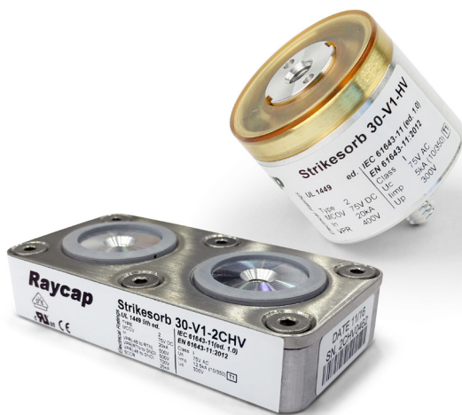
Figure 4. Two of the Strikesorb SPDs from Raycap

Raycap is an international manufacturer and technology leader with decades of experience providing innovative infrastructure solutions for customers in the telecom, energy, defense, transportation, and other industrial markets. Its solutions protect mission-critical applications and ensure the best possible system availability. The company's product portfolio includes lightning and surge protection technologies, structured cabling and connectivity solutions, power management systems, custom enclosures, cabinets, and wireless network concealments. Since its founding in 1987, the company has experienced continuous growth. Its engineering expertise, extensive patents and IP, test laboratories, and multiple manufacturing facilities guarantee quality, reliability, and innovation. Product design, testing, and approval processes comply with all international safety standards. Raycap operates in the United States, Germany, Greece, Cyprus, Slovenia, and Romania.