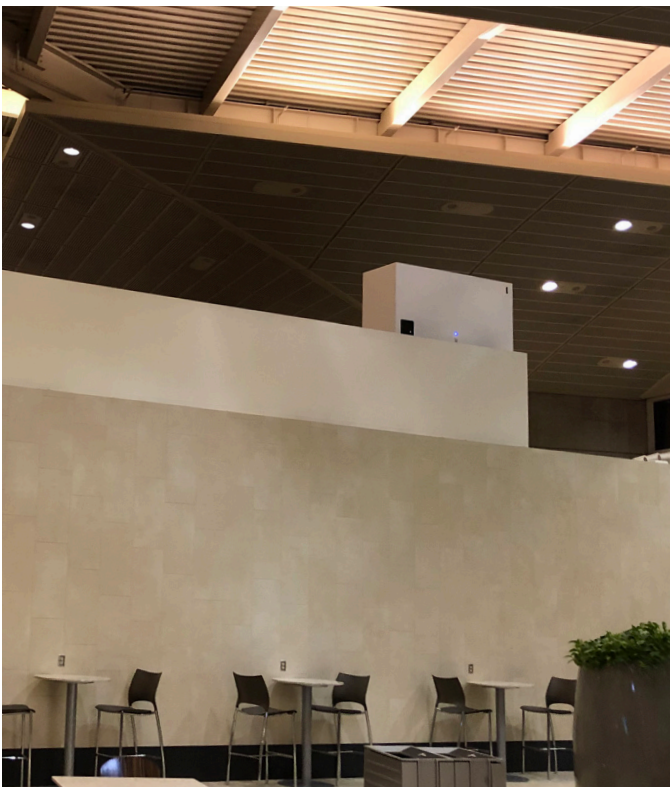
The enclosures are designed and engineered to fit seamlessly into highly trafficked areas such as food courts.

The sides of the enclosures are fabricated with InvisiWave, Raycap's 5G mmWave material which minimizes loss of signal strength at higher GHz frequencies. Fully tested and approved for use at mmWave frequencies