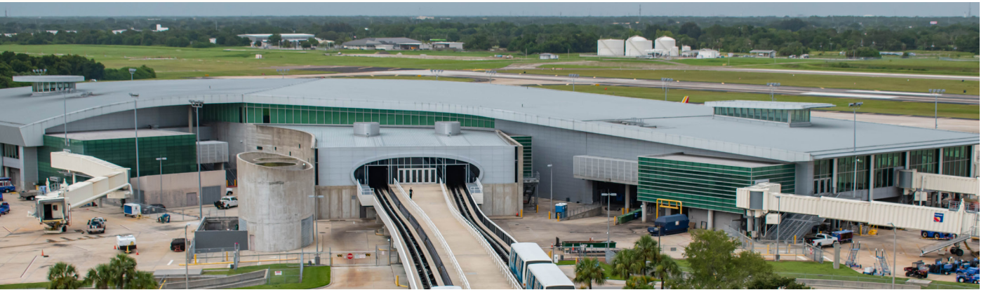
Tampa International Airport

Large venues are looking to augment indoor wireless installations with 5G mmWave services in crowded areas. Custom enclosures are necessary to meet aesthetics and safety criteria and ensure performance for multiple carriers. Raycap's fast design, engineering, and manufacturing cycles met aggressive contractor rollout schedules at Tampa Airport.