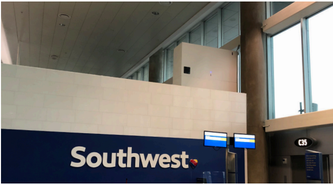
Adding 5G mmWave service improves the user experience for travelers and businesses in the Tampa Airport.