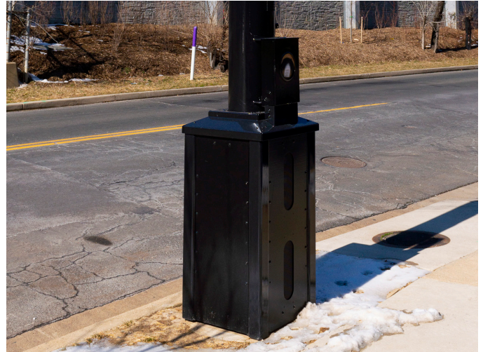
The square base design provides more room for equipment, and removable panels, than a circular one.

Raycap performed a thorough review of the thermal properties of the design, including all the different configurations of equipment that the carriers will want in the enclosure. To ensure operation of high-powered radios during hot Virginia summers, Raycap added six ventilation fans into the doors of the base for active cooling: three fans on one door to pull cool air in and three on the other side for venting out.