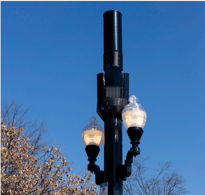
The small cell design includes variations to mount 4G antennas and 5G radios specific to each carrier at the top of the pole.

There are three very similar configurations of each style for different carriers, which leads to six individual designs. All use the same county-specified black color finish. So from the exterior perspective, they are almost indistinguishable, but the interior design and components are customized for the specific equipment that each carrier uses.