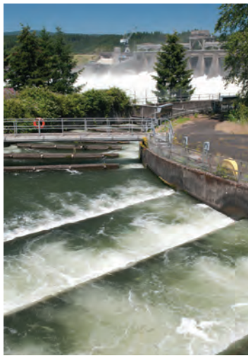
Figure 2: Bonneville Dam and Locks circular fish ladder, Oregon USA.