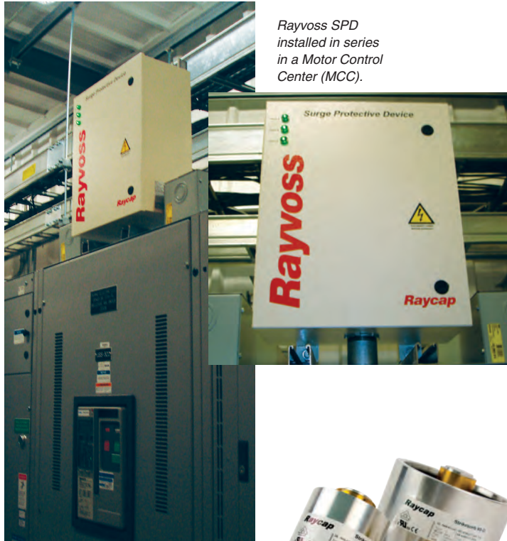
Rayvoss SPD installed in series in a Motor Control Center (MCC).