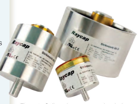
Figure 3: Strikesorb surge protection devices

Raycap is a trusted partner, providing maintenance-free electrical protection solutions for mission-critical applications in hundreds of thousand installations worldwide. For a detailed presentation on how Raycap's Strikesorb-based solutions can protect your oil and gas field equipment, contact us today!