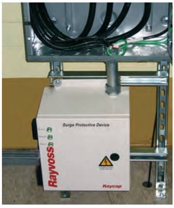
Figure 2: Rayvoss installation inside engine generator shelter.