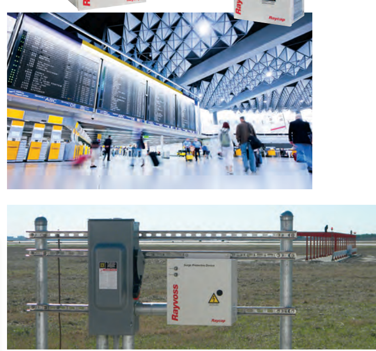
Figure 3: The Rayvoss Surge Protective Device (SPD) protects the incomimg power for the localizer shelter.

Raycap is a trusted partner, providing maintenance-free electrical protection solutions for mission-critical applications in hundreds of thousands of installations worldwide. For a detailed presentation on how Raycap's Strikesorbbased solutions can protect your airport operations, contact us today!