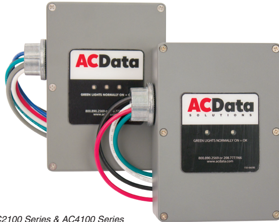
AC2100 Series & AC4100 Series